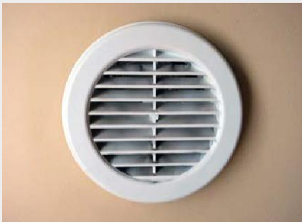
Airlet \approx 2.6 in. 2

For more information see the Building America Measure Guideline Passive Vents at buildingamerica.gov .