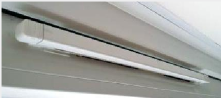
Trickle vent \approx 4 in. 2